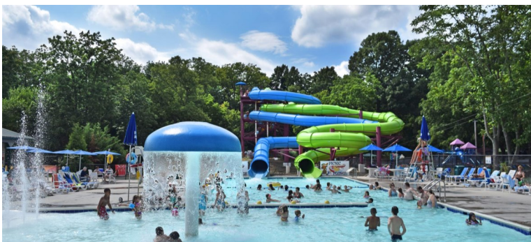
Yogi Bear Camp and Resort

Hagerstown also offers alternative lodging choices like Yogi Bear Camp and Resort, featuring a 22,400 sq. ft. water park & new splash pad!