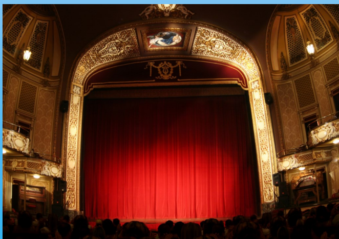
The Maryland Theatre

Download Sample Itineraries at www.visithagerstown.com/groups/itineraries