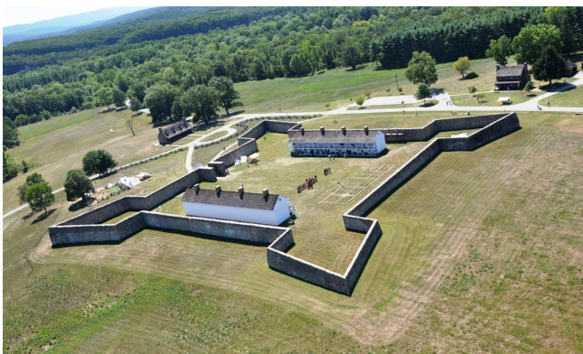
Fort Frederick State Park

Indianapolis, IN Knoxville, TN Louisville, KY Charlotte, SC